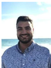
Locum Town Clerk/RFO