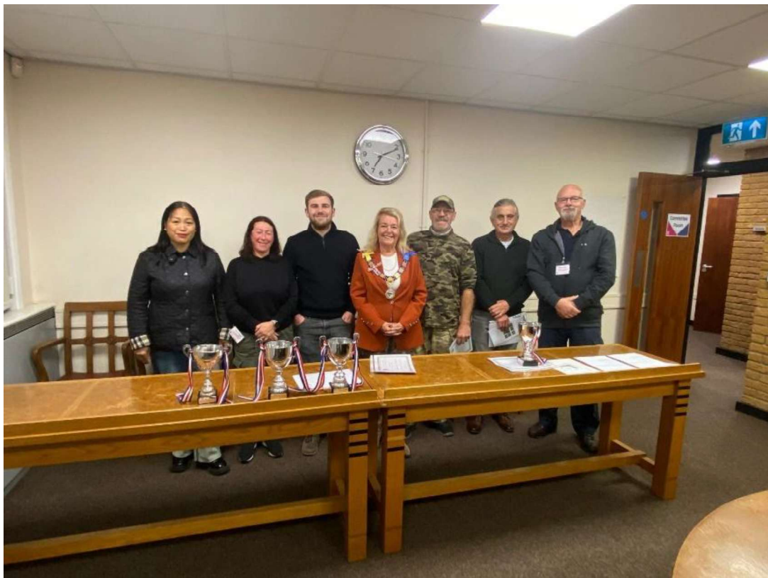
Allotment Prize Winners 2025