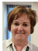
Deputy Town Clerk